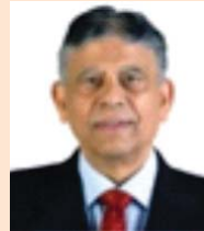
Dr. Vijay Kelkar Chairman Finance commission