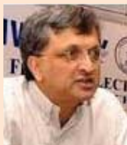
Prof. R.C. Guha Noted Historian