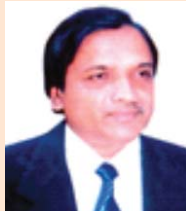
Shri Aurobinda Behera IAS