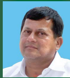
Achyuta Samanta, Founder, KIIT & KISS